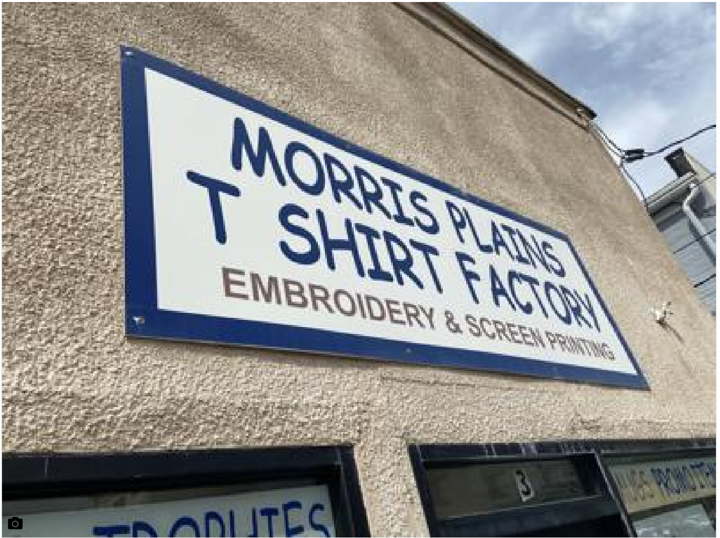
Collins Pub owner eyes reopening at former tee-shirt store

Morris Plains candidates ready for general election campaign